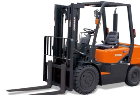
G20G / G25G / G30G 2,000kg 2,500kg 3,000kg Gas, LPG, Pneumatic Tire