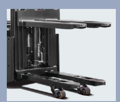
With the upper and lower pallet handling design to meet the stacking operation need and enable a higher efficiency of goods handling