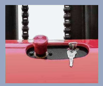
The non-contact proximity switch has a long life and can work reliably