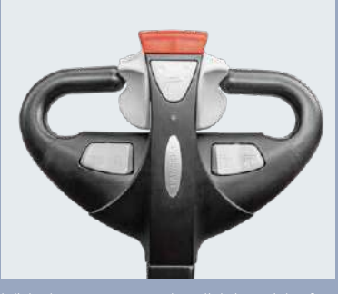
With the compact and stylish joystick of REMA, a German brand, all operations can be completed with one hand