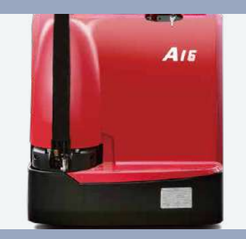
Designed to be narrow with large round corners to improve suitability for concentrated shelves and with a wedge-shape chassis to provide higher passing ability