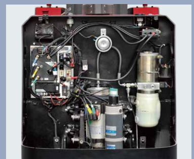
Fully opened hood, easy accessibility of all components, is easy for service