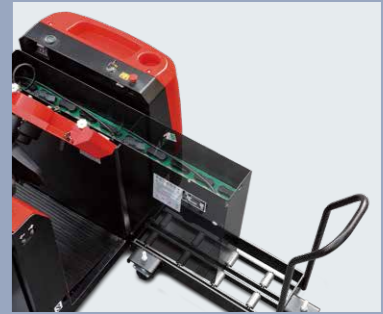
Side battery changes is standard feature