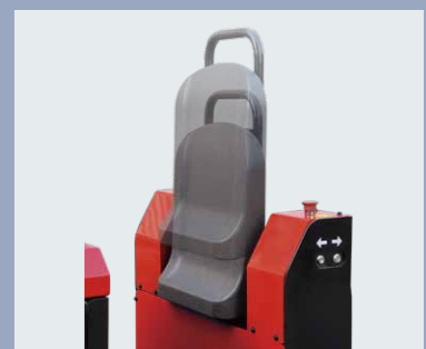
Backrest height can be adjusted within a certain range, and the backrest with hip support can greatly improve the comfort of the operator