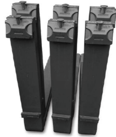
Higher specification fork mounting level-2B, more weight can be loaded.