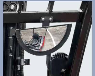
Panoramic rearview mirror