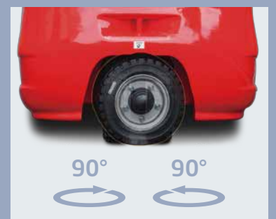
The small turning radius is suitable for narrow channel