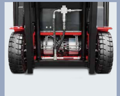
Front dual separated motors